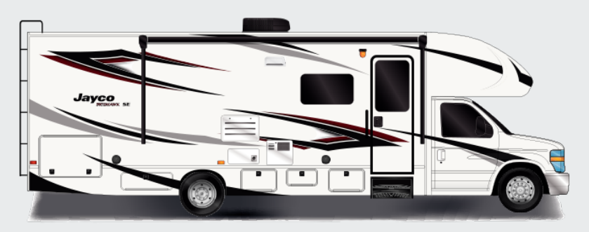
Standard Graphics Package