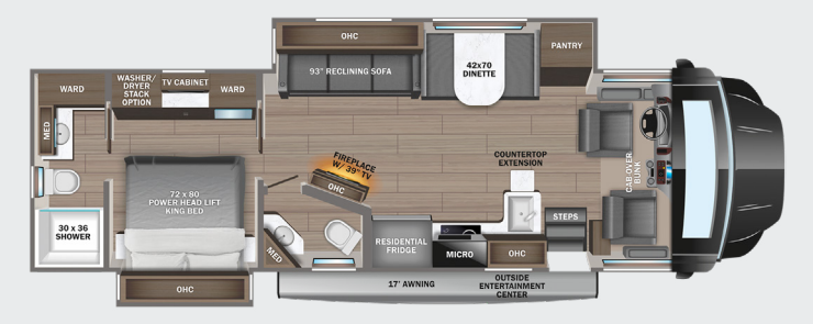
37L OPTIONS: A, B