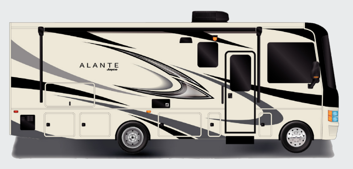
Standard Graphics Package