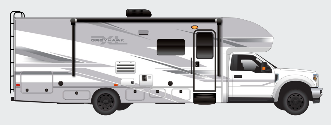
Partial Paint Package