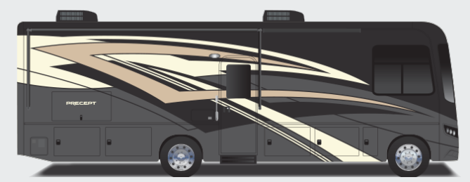
Java Full-Body Paint