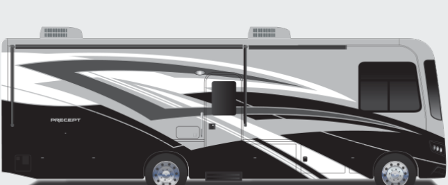
Peppercorn Full-Body Paint