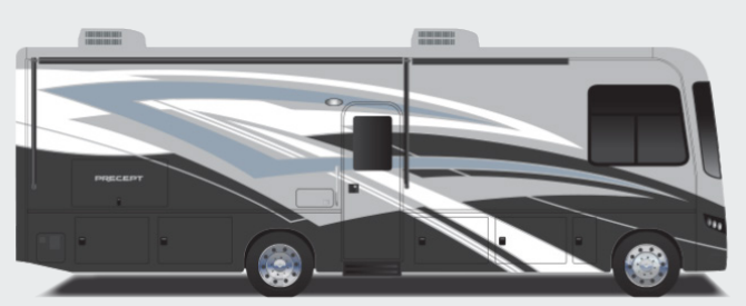
Soul Blue Full-Body Paint