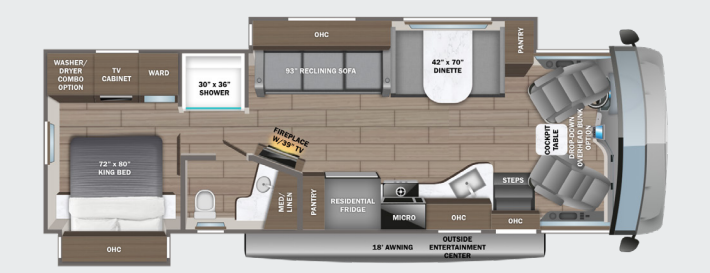
34G OPTIONS: A