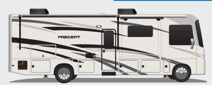
Standard Graphics Package