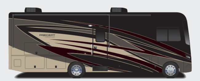
Warbler Full-Body Paint