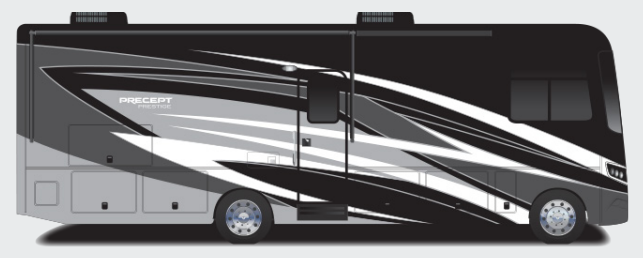
Chickadee Full-Body Paint