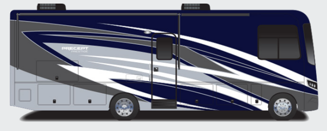
Oriole Full-Body Paint