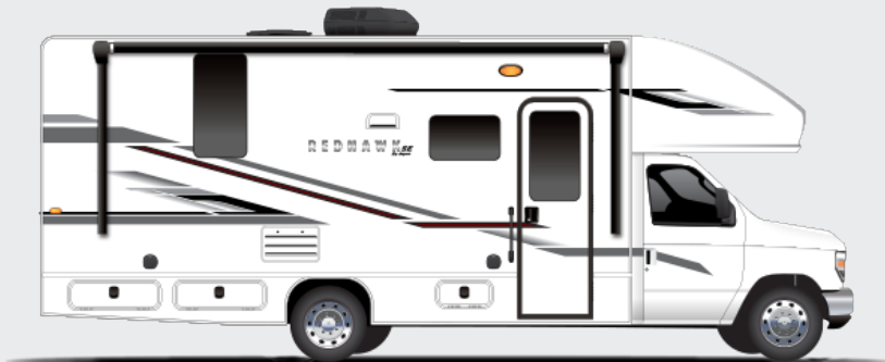
Standard Graphics Package