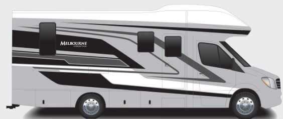
Shale Full-Body Paint