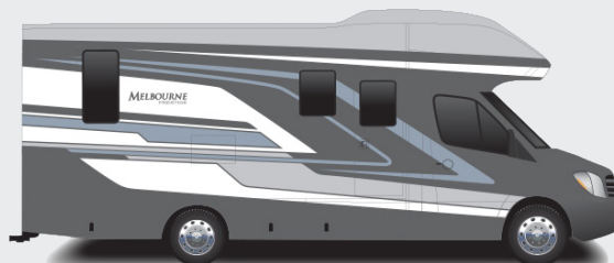
Seaside Full-Body Paint