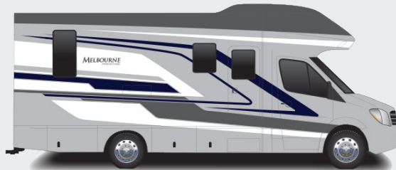
Admiral Frost Full-Body Paint