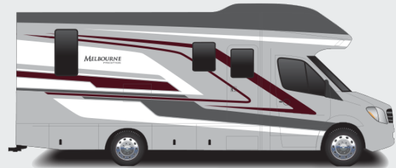
Luxardo Full-Body Paint